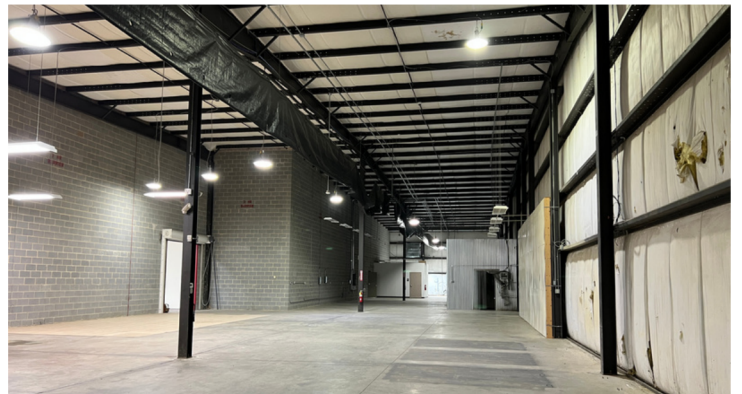
MAIN BUILDING | WAREHOUSE