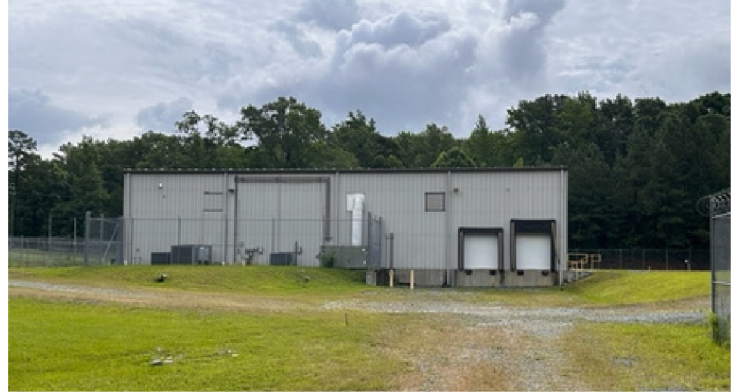
MAIN BUILDING | MECHANICAL & LOADING